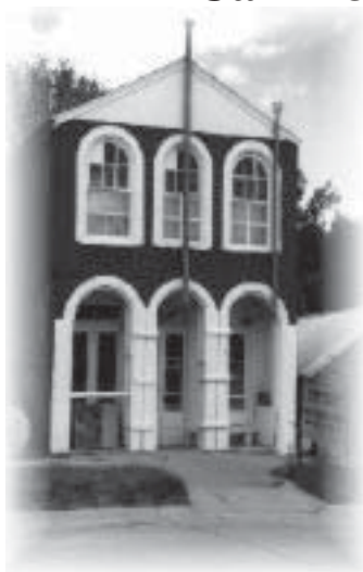
Brownville Mills formerly "The Lone Tree Saloon"

Call 1-877-559-6005 to see what's happening in Brownville this month!