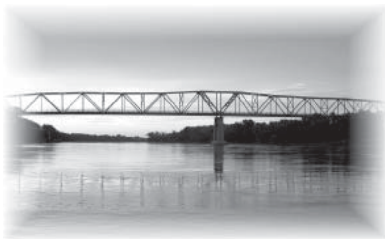
Missouri River Bridge