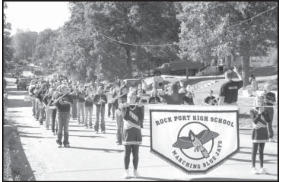
Rock Port was represented in the Peru State College Homecoming Parade.

And as I look through my window on Fifth Street for signs of the holidays, I see a vision of our country neighborhood. I see that someday all men and women and children of Auburn, and Nemaha County, and Southeast Nebraska, and the all people of this four-corner region, will only need one newspaper to read. It will be the only newspaper they will have to buy. It will have world news, and national news, and business news, and agricultural news, and sports, and arts, and entertainment news, and local rural news . It will have your news. It will have everything for which readers buy a "World Herald" or a "Journal Star" or St. Joseph..., or a Topeka..., but without having to search through a big paper pile every Sunday to find YOUR LIFE. I am thankful for this inspiration, for living in this area, for its beauty, for my friends, and for the public's acceptance of this publication. And I owe it all to the view that I see through my Window on Fifth Street.