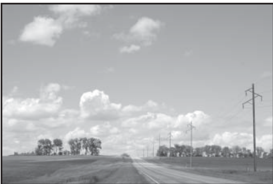
...and I observed my normal routes in a different way.