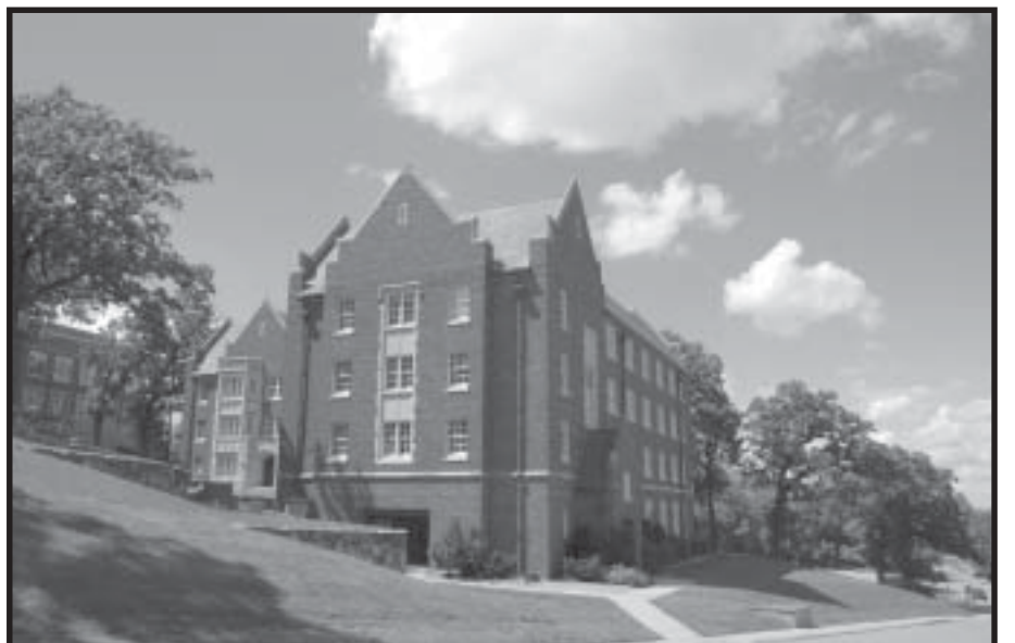
Peru State campus is always is picturesque.