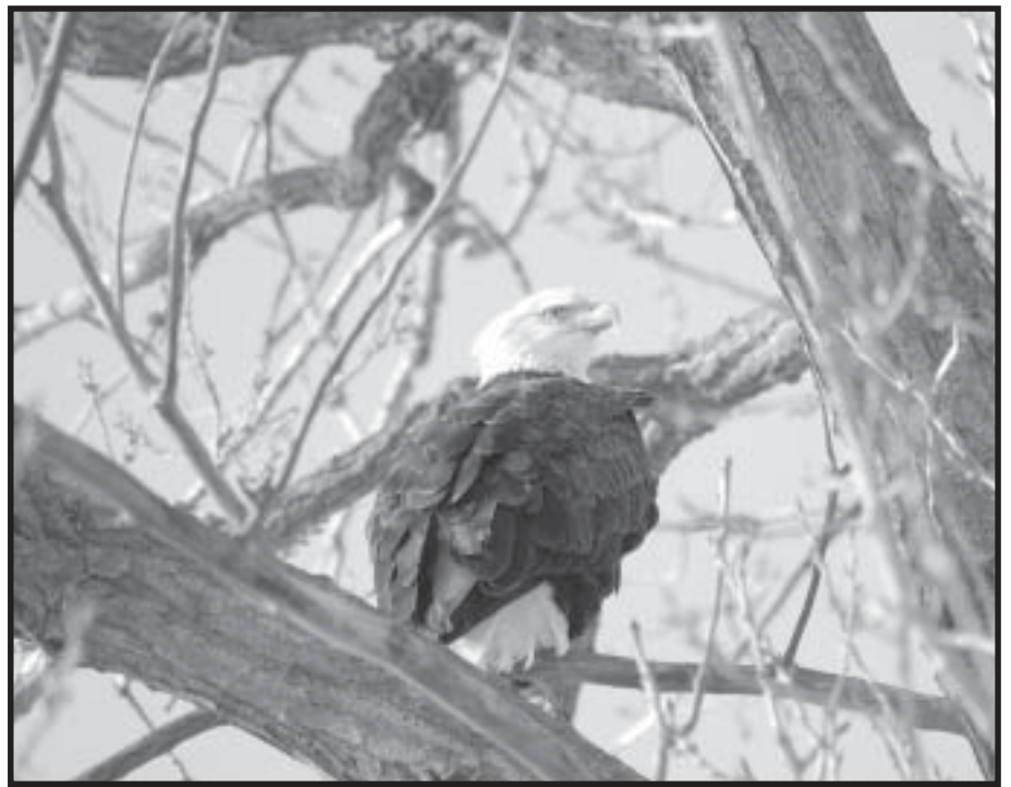
I'm fortunate to live where Eagles soar.