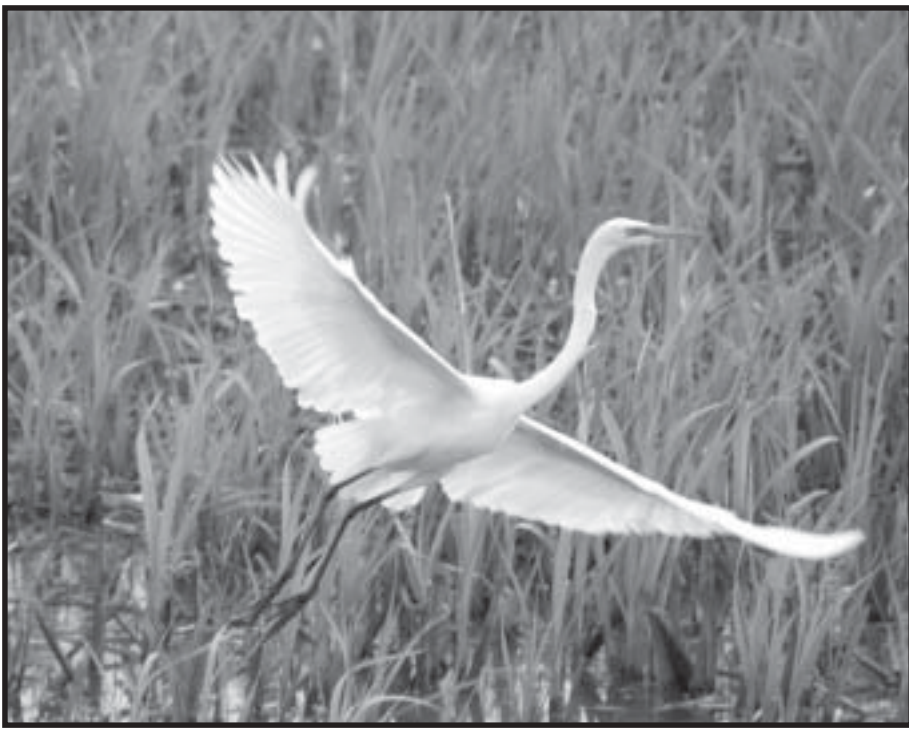
I found exotic birds...