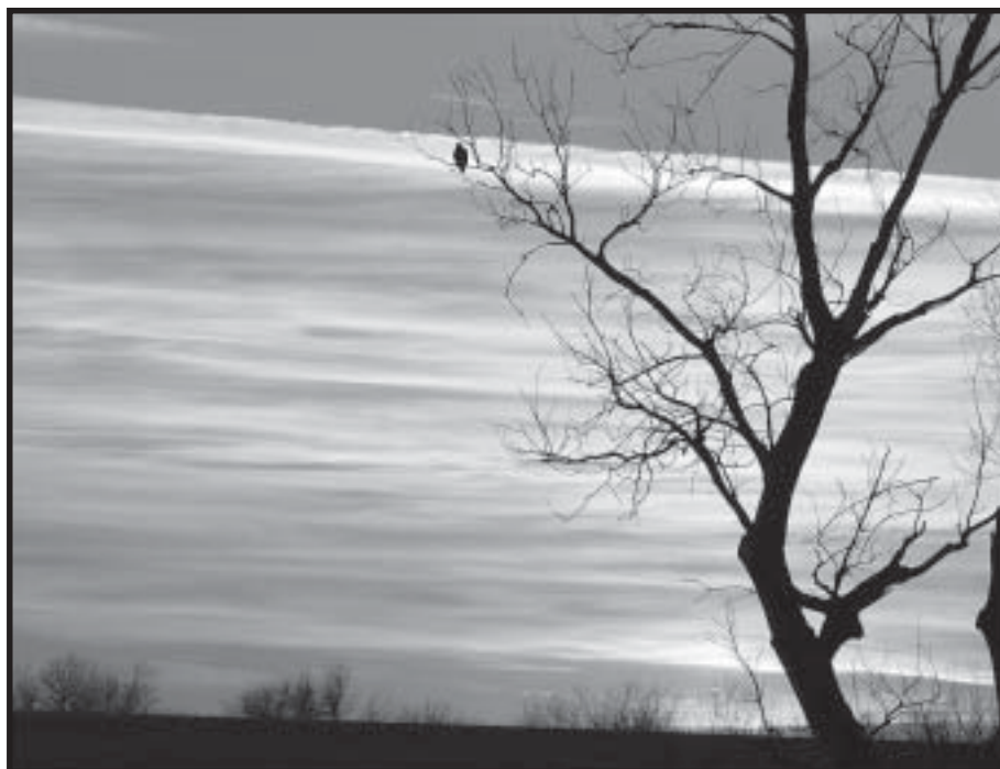
We have great sunsets in Southeast Nebraska; it's hard to choose, but I found a few to publish, and I'll find more. In the meantime, I wish you a Happy New Year.