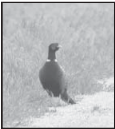
as well as familiar.