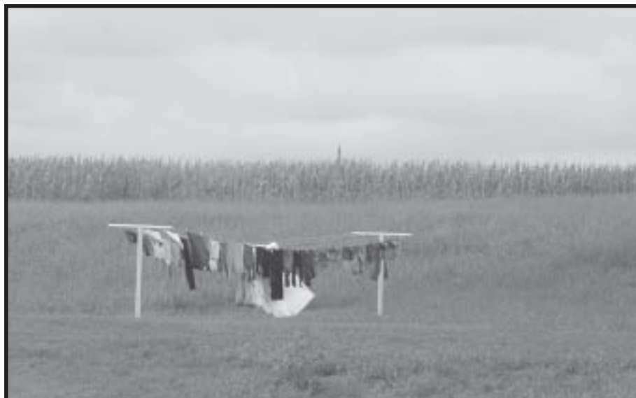
This reminds me of clean air and summer breezes.