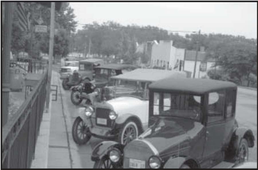
There were many fun events in Brownville.