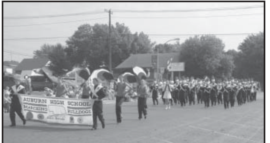
The Auburn High School Marching Band made a good showing in one of Syracuse's 2005 events.