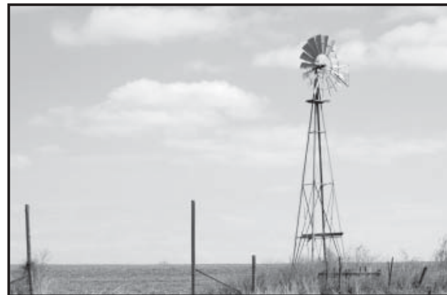
I frequently brake for windmills.