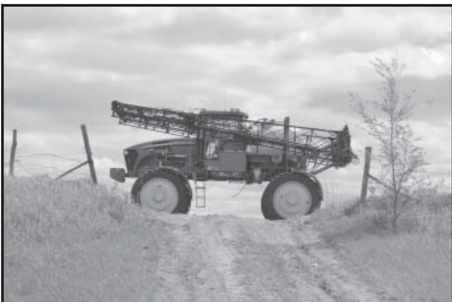
In 'Ag' communities, this is a sign of Spring too.