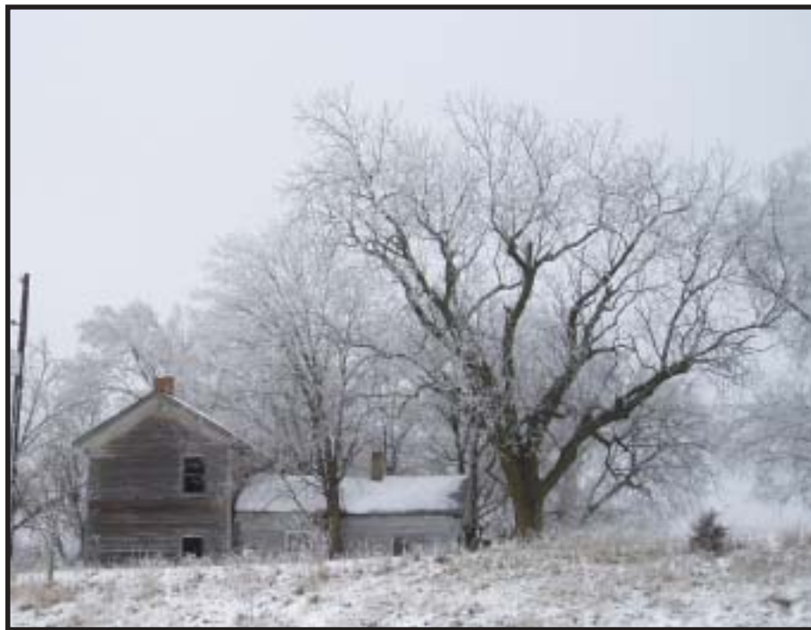
Old farm houses remind me of my roots.