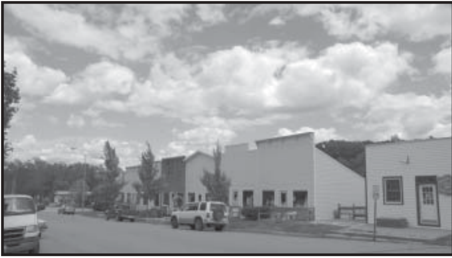
I visited picturesque Brownville a lot.