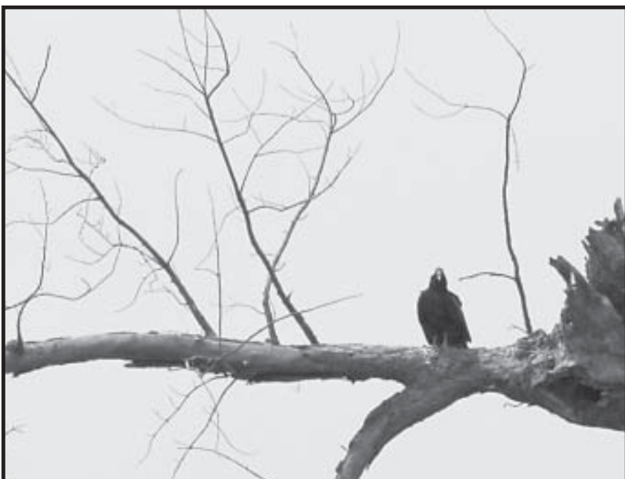
Some with bad breath.