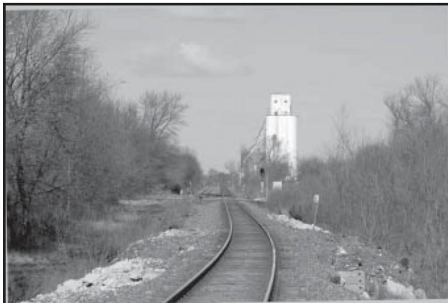
And this says both 'Mid West' and 'far away'.