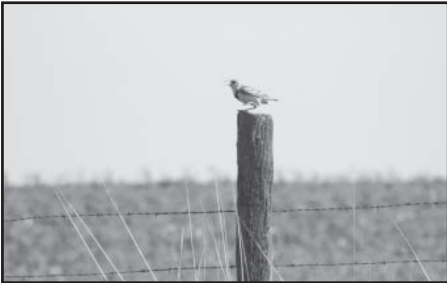
Some with sweet, melodious songs...