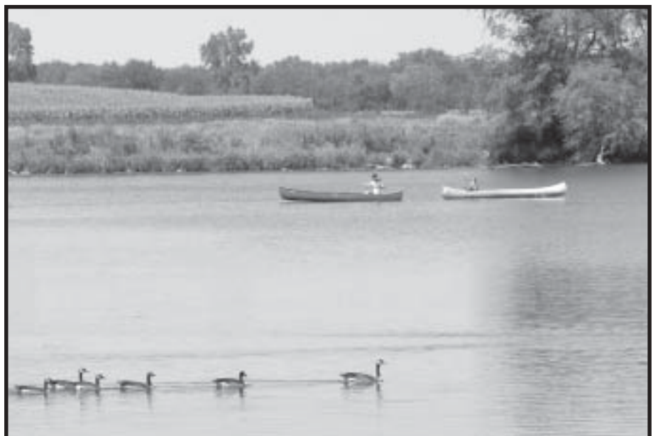
Coming and going at Verdon State recreation Area.