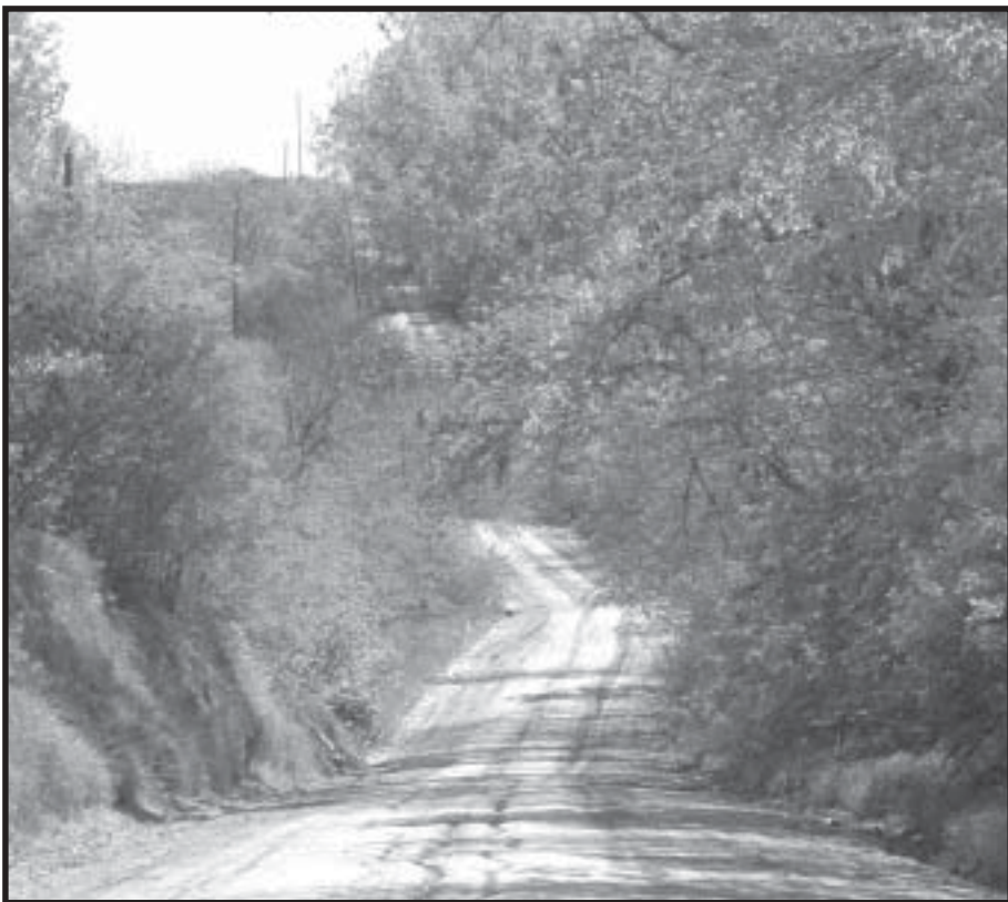
I found different roads that I had not driven before...