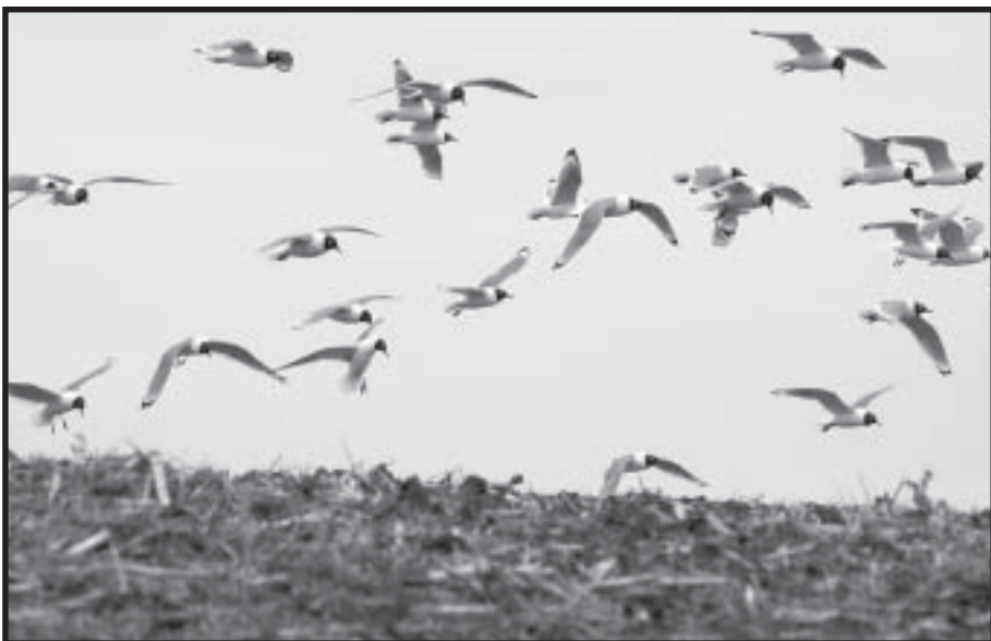
These 'Plow Birds' were one sign of Spring.