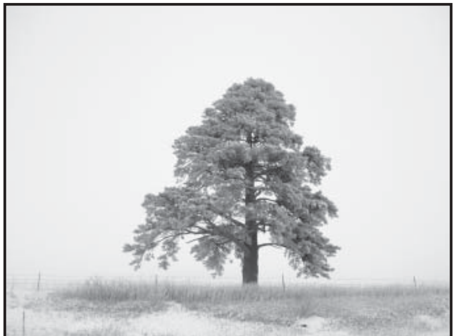
Trees pose the best.