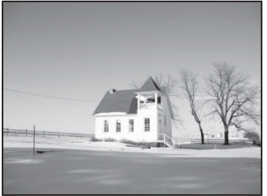
This little school is south of Tabor,