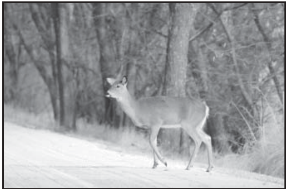
Still, I am frequently surprised.