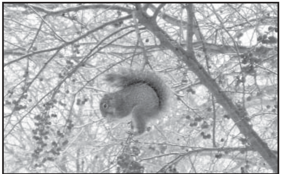
Wildlife pose for me wherever I go.