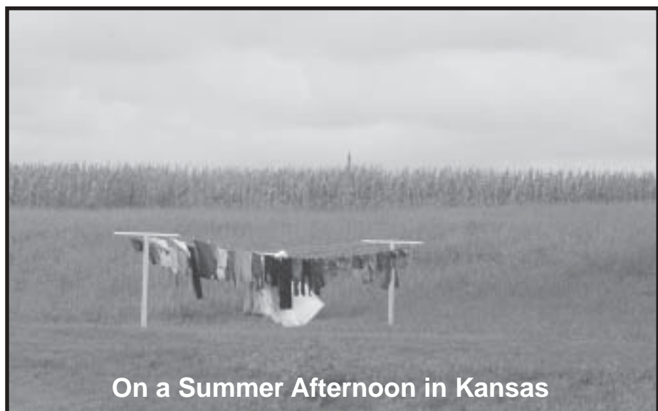
On a Summer Afternoon in Kansas