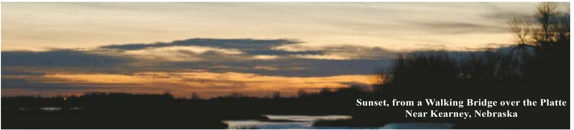
Sunset, from a Walking Bridge over the Platte Near Kearney, Nebraska