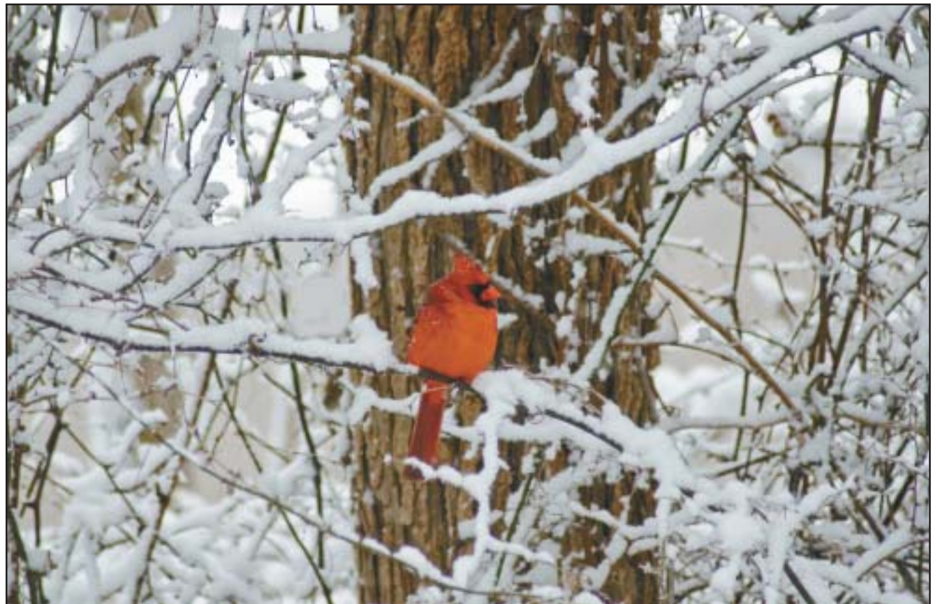
Morning after that last snow in March.

Deadlines and dates are jokes enjoyed by the invisible form of mother nature. We may picture her as a benevolent and cheery type, who loves to please her children with crocus blossoms and tulips. Sometimes she decorates them with a lacy coating of the most perfect snowflakes, that wander out of the sky like lost tourists who've boarded the wrong bus. But that nurturing type who only exists in our imagination may be more of a wicked witch, whose moods can be as dark and deadly as black ice in a whiteout wind. The cackle of her laughter is drowned out by the cacophony of a multiple car crash on a bleak and blustery stretch of interstate whose lanes will soon be closed.