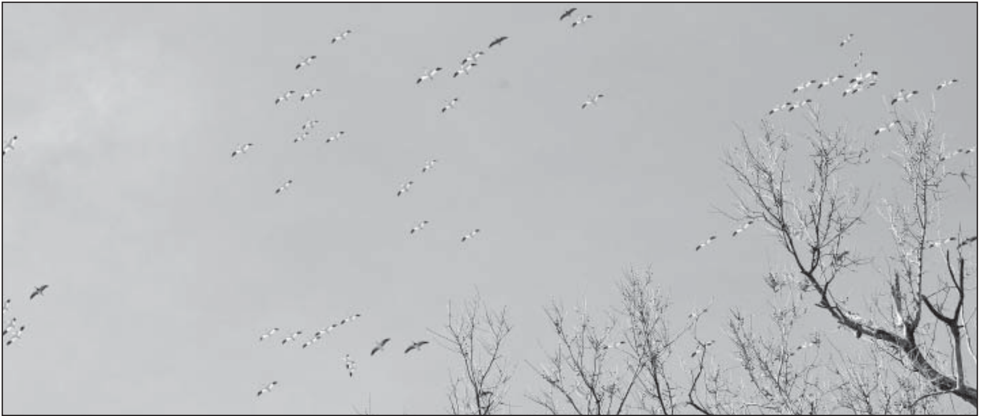
Snowgeese migrating north on a warm day in late March. These above the I-80 Exit 312 at Grand Island.