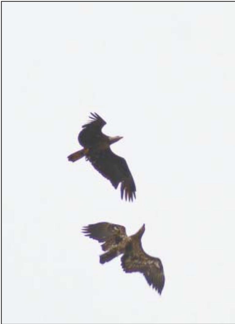
Bald Eagles, Adult and Juvenile Spinning in Flight