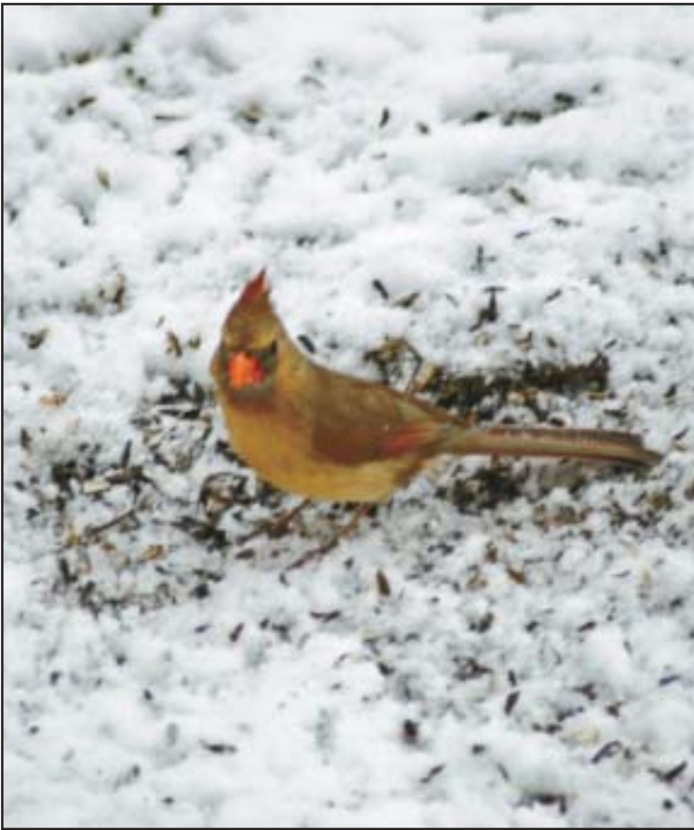
Young Lady Cardinal, too timid to eat from feeder.