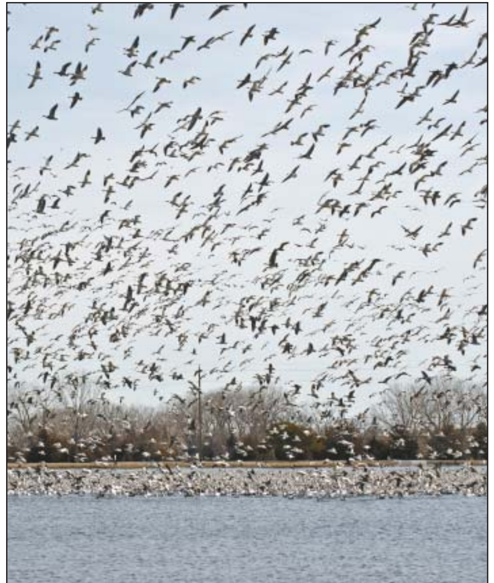
Snowgeese 'dropping in' at a State Park, Just off I-80, Exit 312 at Grand Island.

As Always, Karen (I wish I had that car back)