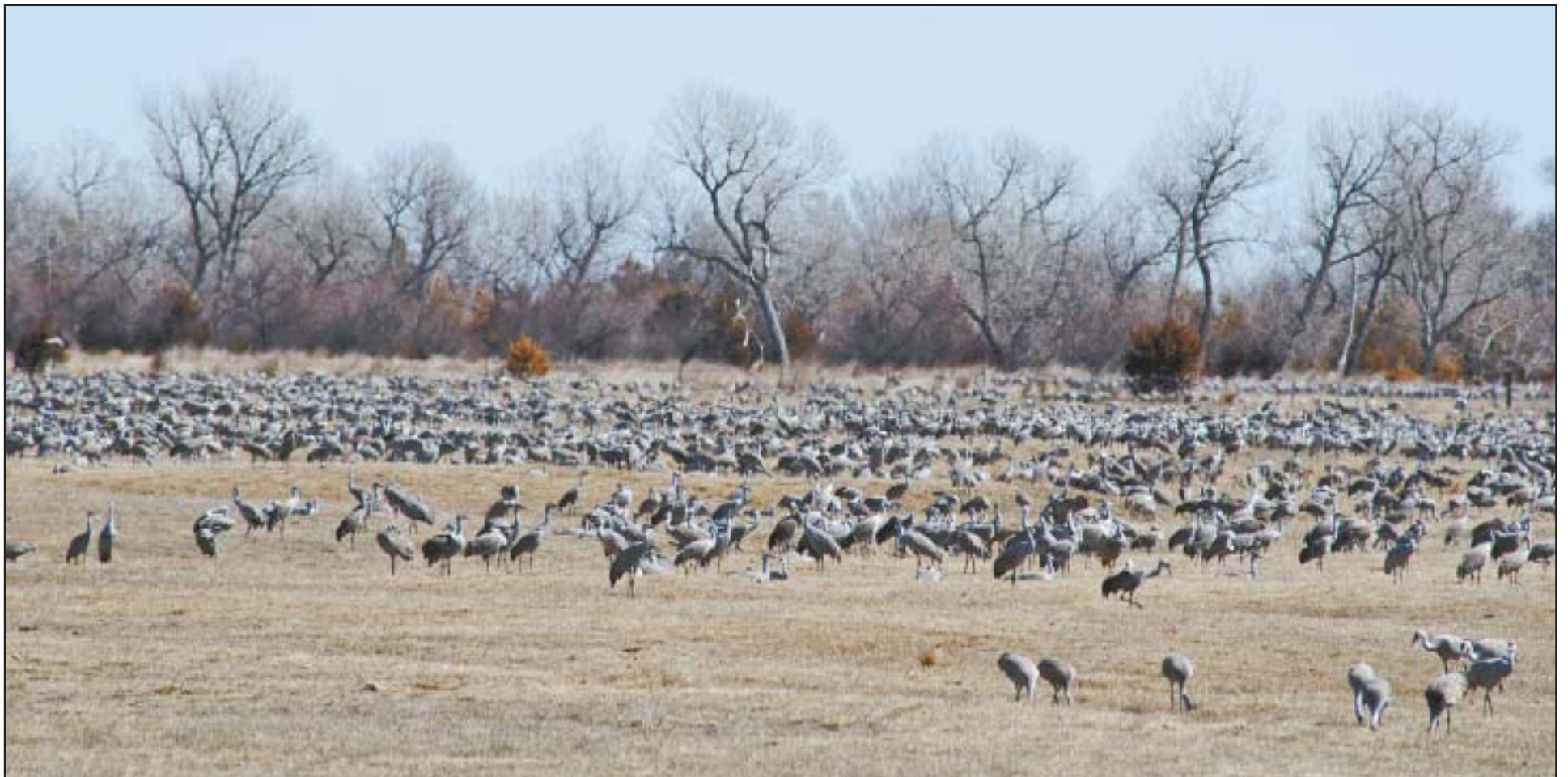
Sandhill Cranes near Kearney, Nebraska, March 13, 2013