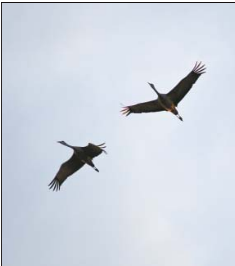
Silhouette of Sandhill Cranes, Dawn, March 14, 2013